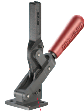
Removable handle stop can be repositioned to limit opening angle to 90°